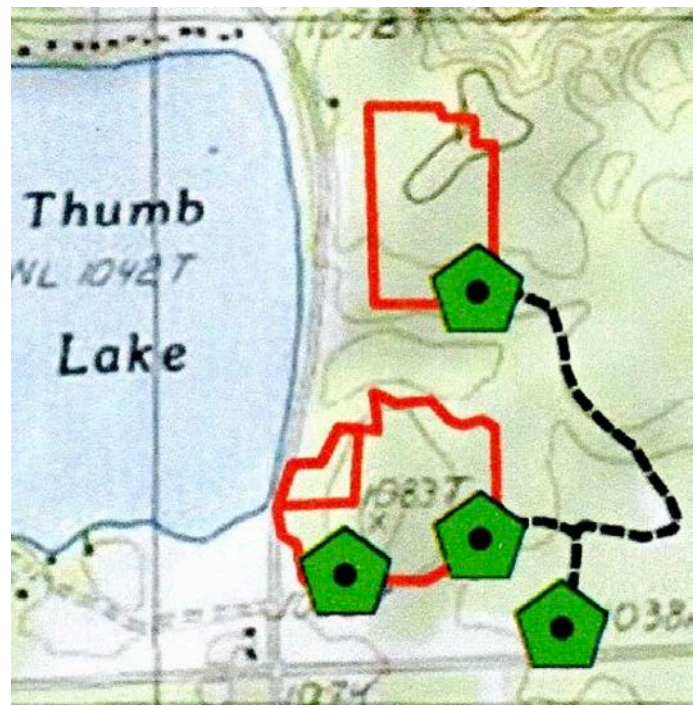
Three red pine stands at the east end of the lake